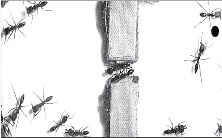
A jumping Ponerine ant. From an original photograph.

At the end of World War II, the Washington Office of Scientific Research and Development, as a part of a closing